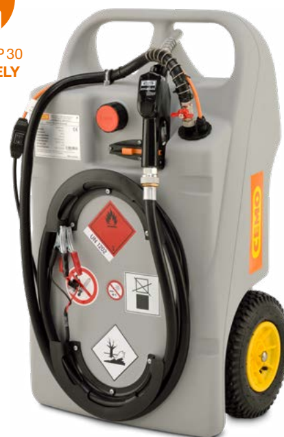
Diesel trolley 100 L with 12 V pump CENTRI SP30