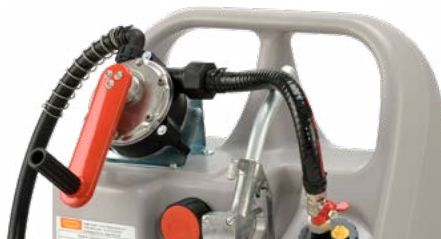
Diesel trolley 100 L with crank pump