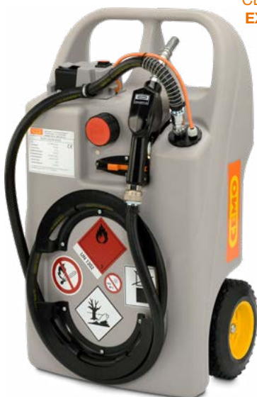
Diesel trolley 60 L with 12 V pump CENTRI SP30 and battery