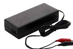
Charger for versions with battery