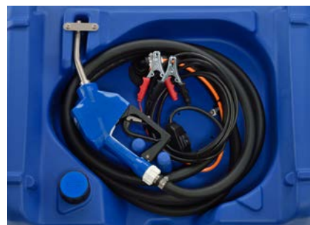
210 L with CENTRI SP30