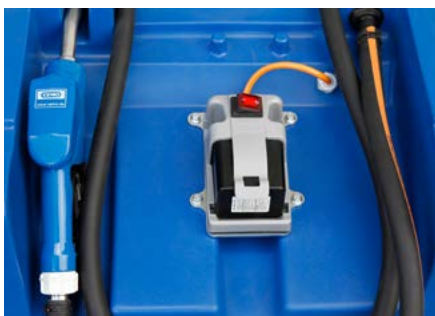
125 L with CENTRI SP30 and LiFePO 4 battery (characteristics see page 103)